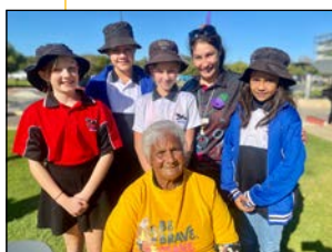
See Latest News on the School Website