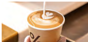
Coffee Cart 6:30am – 9:00am

Date: Monday, 6 May 2024 Time: 6:30am – 9:00am and 3:00pm – 5:00pm Location: Vasse Primary School