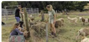
Animal Farm 3:00pm – 5:00pm

Visit our service and grab your morning coffee on us.